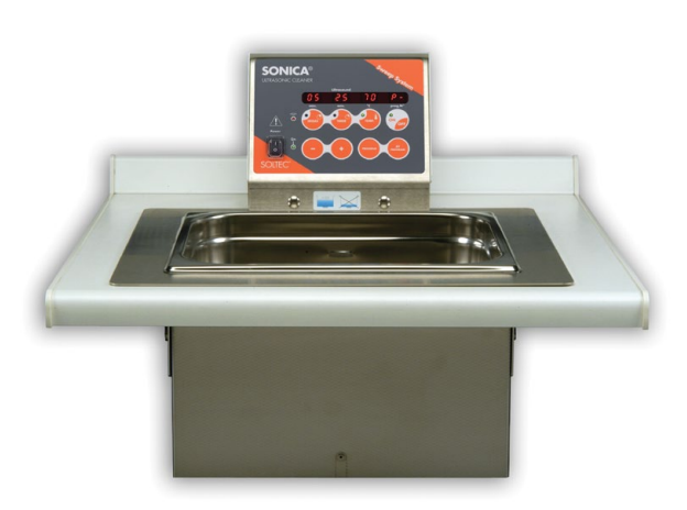
Front view of the SONICA unit flush-mounted to the work surface