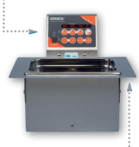
Outer flush-mounting rim